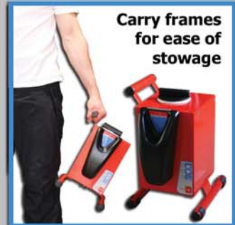
Carry frames for ease of stowage