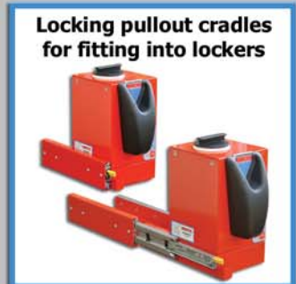
Locking pullout cradles for fitting into lockers