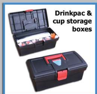
Drinkpac & cup storage boxes